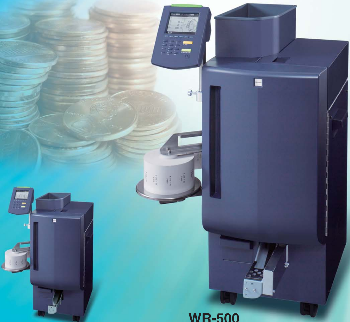
WR-90 Standard model