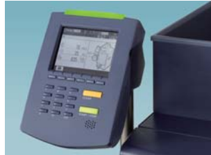
▲ Built-on LCD control panel

With utilization of built-on LCD control panel, screen visibility and operability were improved dramatically. The processing mode and data contents may be checked quickly and easily. Furthermore, easy-to-understand illustrated operation guide provides accurate and applicable support.