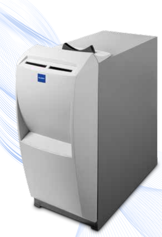
(shown with dual dropbox facade)

Improved transaction efficiency reduces customer wait times and allows your staff to deliver a better overall experience to your customers.